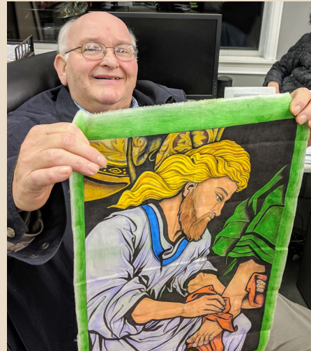
A Gift Jimmy Received From An Inmate.